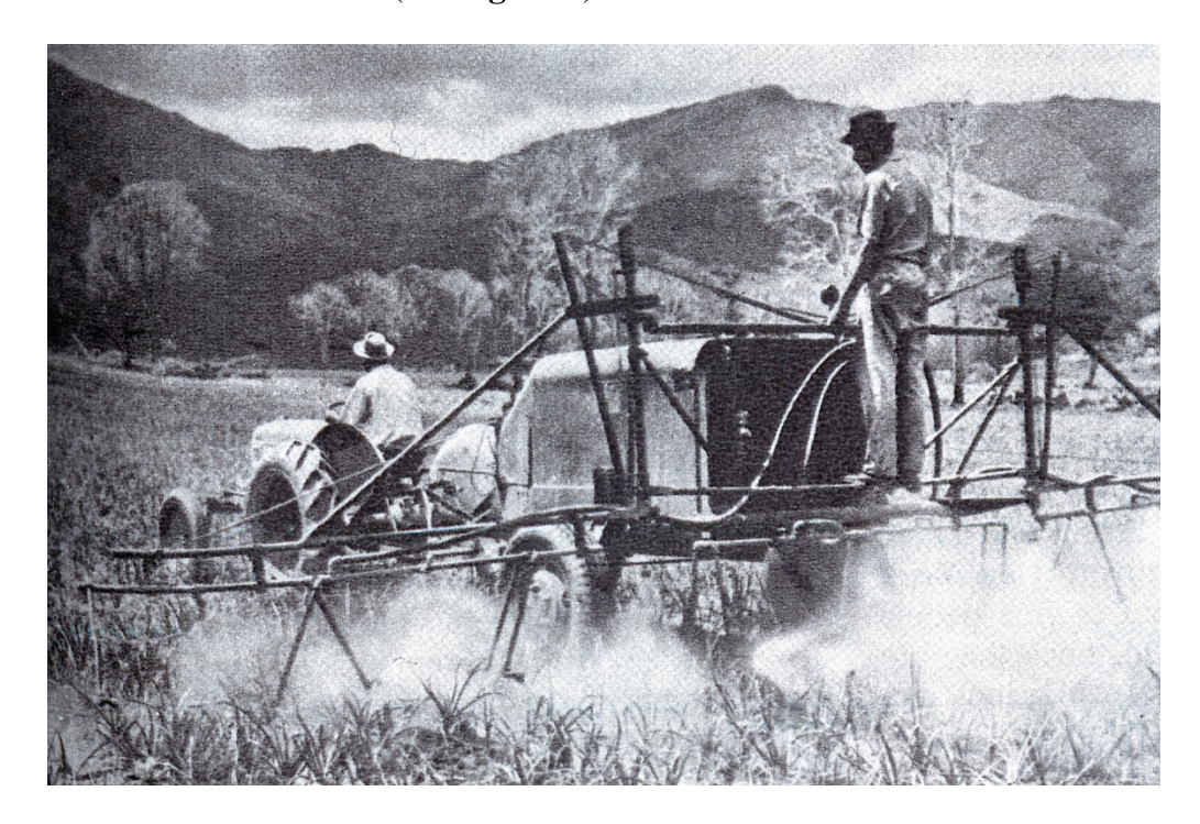
Figure 1: Pesticides being sprayed on a PACA onion farm in Venezuela. American Magazine , Sep. 1949, 29.

DDT, Toxaphene, and benzene hexachloride."<sup>40</sup> Petrochemicals were assumed to be responsible for America's dramatic increase in farm productivity at mid-century, and so were seen as essential to success in Venezuela (see Figure 1 ).