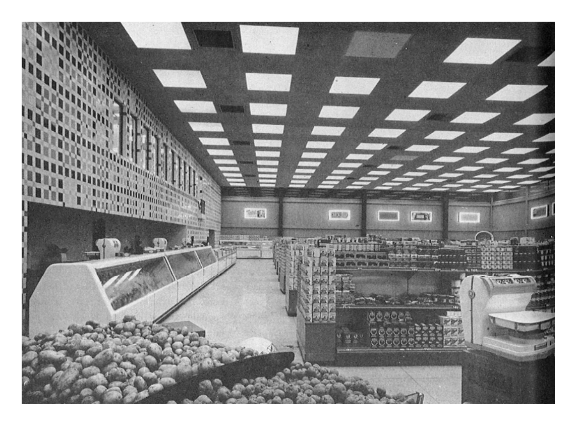
Figure 3: The interior of the Las Mercedes supermarket. Progressive Architecture , Oct. 1955, 116.

Even with affluent customers forming their core market, however, VBEC's Maracaibo supermarkets—operating under the name TODOS (Spanish for "everything" or "everyone")—gained "public acceptance ... beyond all expectations," with prices running about ten percent lower than competitors'. Most promising from the standpoint of VBEC's broader political objectives, the TODOS supermarkets were forcing local grocers to operate on thinner margins (albeit "unhappily"). Although CADA took a net loss for the 1950 fiscal year, its sales of nearly similar margins in New York, as did TODOS's net profit of $282,000 on sales of $3.2 million. Particularly impressive were TODOS's low operating expenses, which rang in at almost half those of comparable U.S. supermarkets, thus allowing the stores to garner